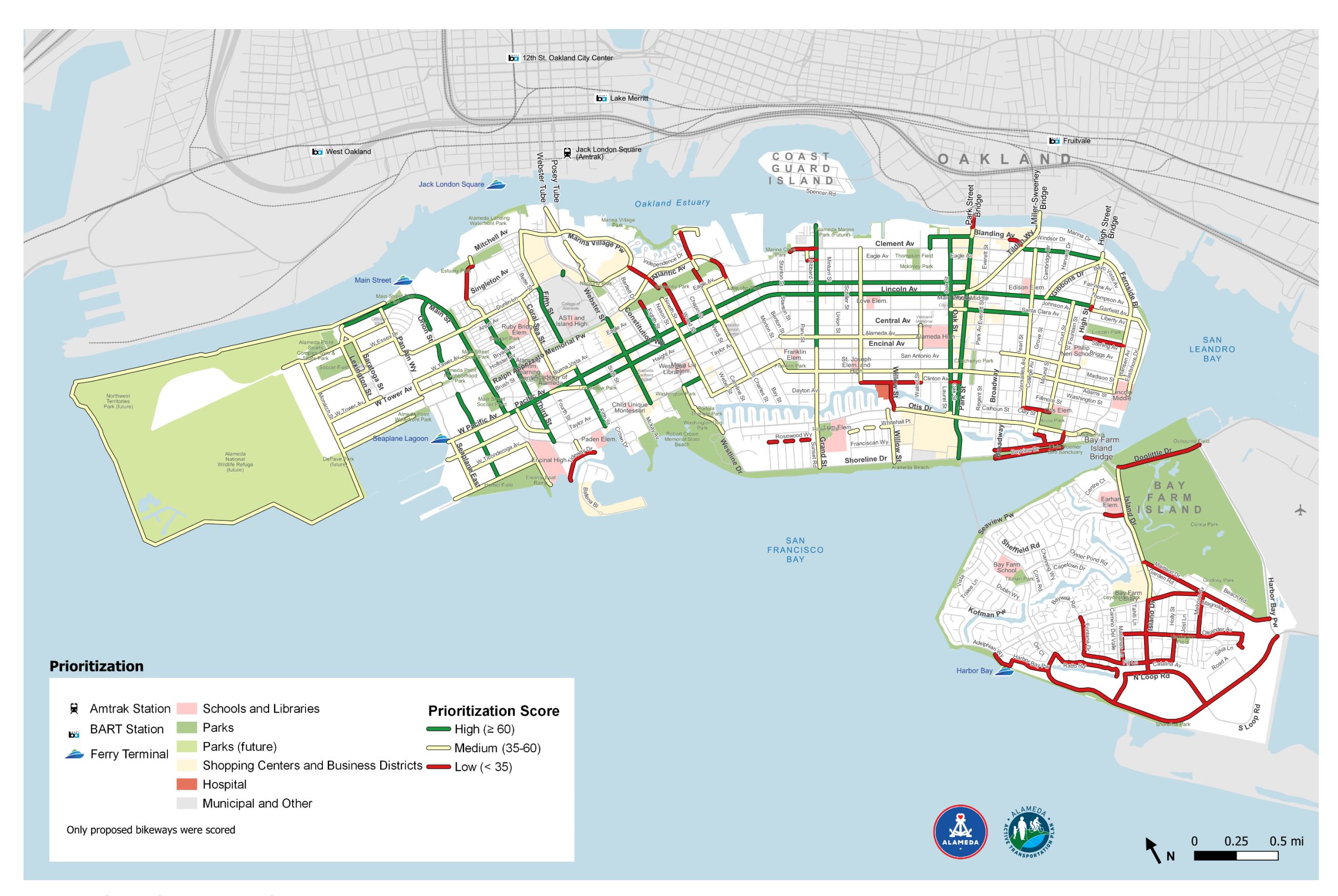
Figure 1. Bicycle Network Prioritization Results.